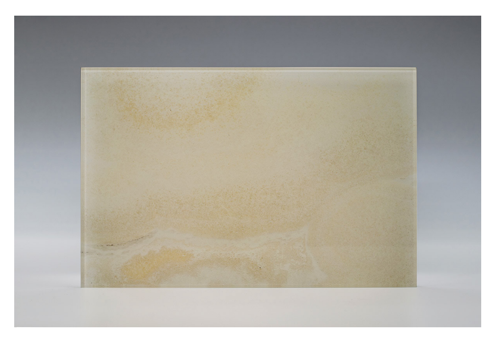
dim. 300 x 200 mm

We create a magnificent stone effect by digitally printing a natural stone texture, marble or onyx pattern in high resolution. Our stone samples are high-resolution scans of real minerals, manipulated so that there is no pattern repetition on the glass surface. These are simple and economical solutions for all interiors, especially where the price of real stone is not acceptable. Perfect for large public and private spaces. Backlighting gives this kind of glass a nice transparency and luxurious feel, especially where natural or reflected light cannot penetrate, for example in hotel receptions, bars, restaurants and other hospitality venues.