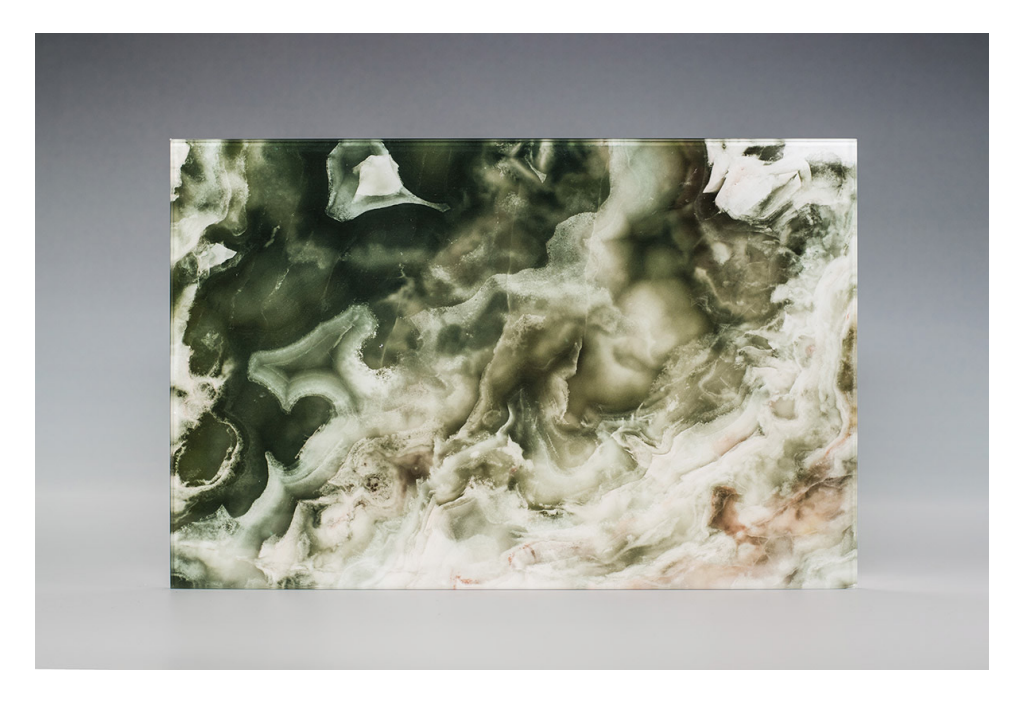
dim. 300 x 200 mm

We create a magnificent stone effect by digitally printing a natural stone texture, marble or onyx pattern in high resolution. Our stone samples are high-resolution scans of real minerals, manipulated so that there is no pattern repetition on the glass surface. These are simple and economical solutions for all interiors, especially where the price of real stone is not acceptable. Perfect for large public and private spaces. Backlighting gives this kind of glass a nice transparency and luxurious feel, especially where natural or reflected light cannot penetrate, for example in hotel receptions, bars, restaurants and other hospitality venues.